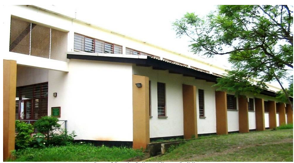
Part of Bunda College Library Building

The Library is composed of the following sections/areas: